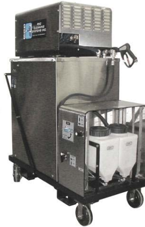
5.4 gpm @ 3000 psi with optional stainless steel wrap, cart and dual chemical system