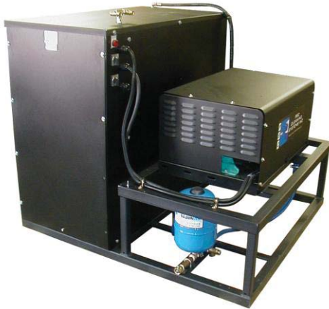
8 gpm @ 3000 psi with optional SRA surge relief assembly