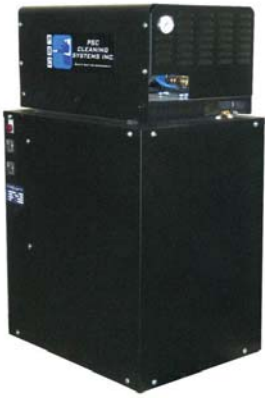
5.4 gpm @ 3000 psi max.