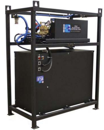
6gpm @ 5000 psi with heavy-duty lifting skid