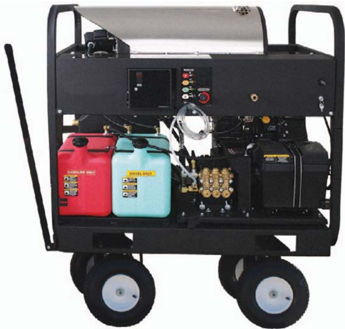
HDC-4004-0K6A shown with optional wheel kit (AW-5740-0000)