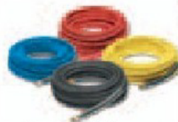
Heavy-duty, high-pressure hoses in lengths up to 150-ft.

Telescoping wands extend to 24' to reach high places without scaffolding