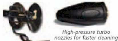
High-pressure turbo nozzles for faster cleaning