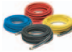
Heavy-duty high-pressure hoses in lengths up to 150-ft.

360° Pivot and non-pivot hose reels keep hose neatly stored and shop areas safe