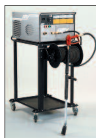
Optional Hose Reel Kit, Cart, Caster Wheel Kit and stainless steel base and cover