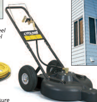
Rotary surface cleaner attaches to your pressure washer; reduces overspray and zebra striping