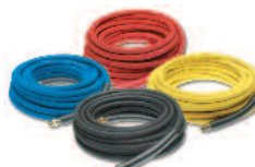
Heavy-duty, high-pressure hoses in lengths up to 150-ft.