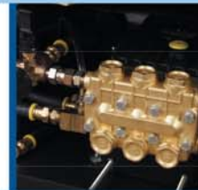
Belt drive triplex General or AR plunger pump