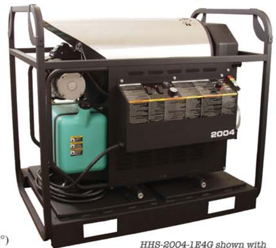
HHS-2004-1E4G shown with skid frame (HX-0196) option