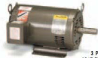
3 PHASE 184T FRAME