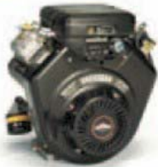
VANGUARD, V-TWIN OHV

Briggs & Stratton's top-of-the-line engines have proven performance in the pressure washer industry.