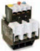
XT Overloads for DP Contactors